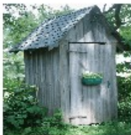
Denise Crossland Possum Queen