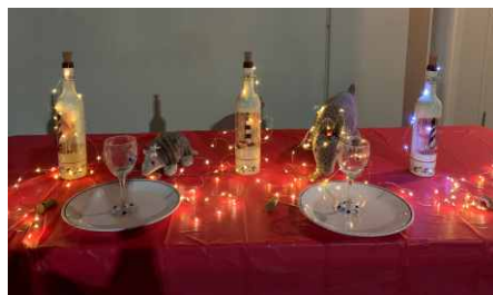
Drive thru Shrine dinner